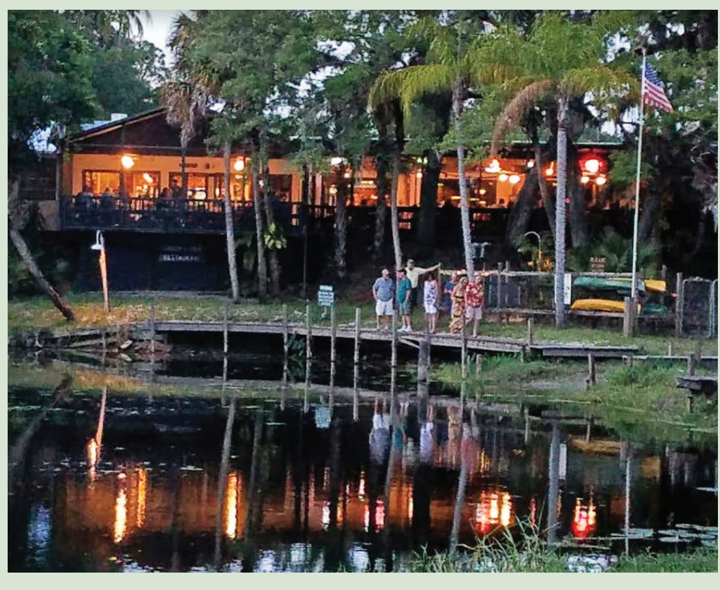
The restaurant offers a scenic view of the Braden River.

In addition to many of the same amenities found today, "modern housekeeping cottages"